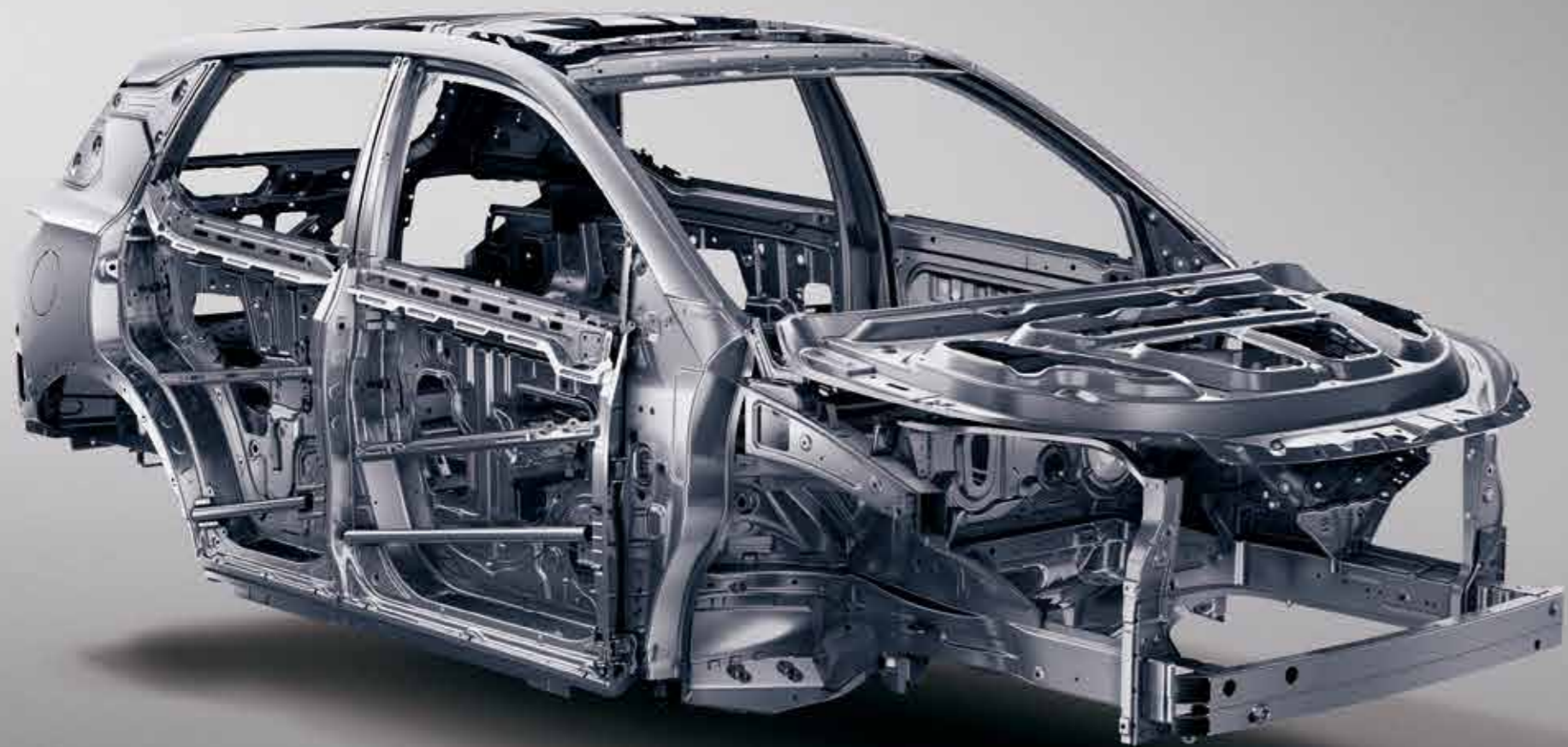
GAC2.0 high-strength steel body work for ultimate safety

Advanced safety technologies for better protection.