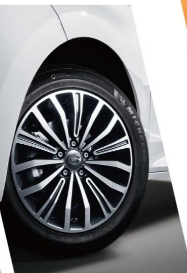
17-inch MICHELIN PRIMACY 4 Tyres

With various powerful electronic functions, the shark fin antenna is a perfect combination of fashion and functionality.