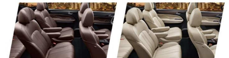
Dark Interior Light Interior