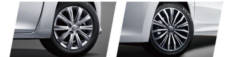
16" Aluminum Alloy Wheel 17" Aluminum Alloy Wheel